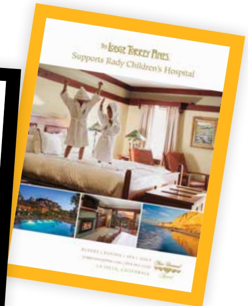
Sample Special Edition Program full-page ads

To invest in the future of our community's children, join us as a sponsor or advertiser today. Your name, or that of your family or business, will be featured in our 112th Anniversary Charity Ball Special Edition Program .